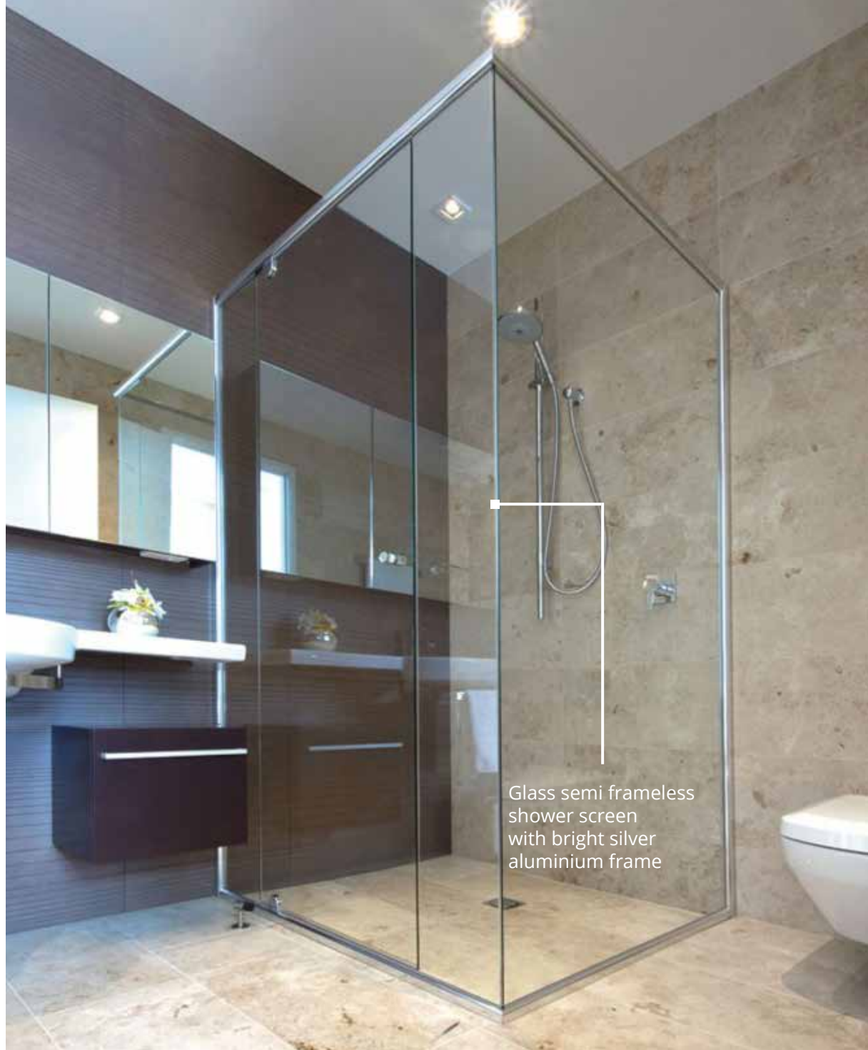
Glass semi frameless shower screen with bright silver aluminium frame