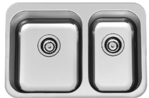
Clark polar range overmount drop in double sink (PPL20B.1)