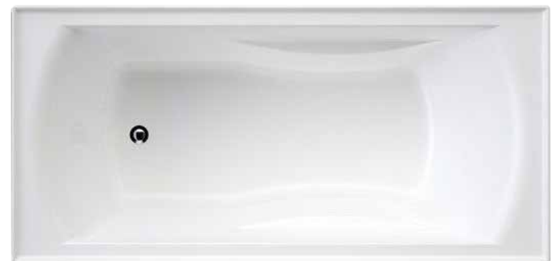
Caroma Maxton 1675 bathtub (MX7W)