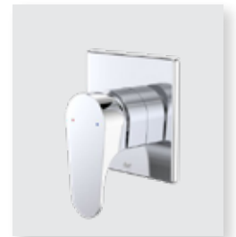
Dorf Viridian bath mixer tap with square plate (811015C)