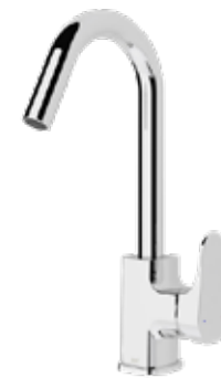
Dorf Viridian sink mixer (81101C4A)