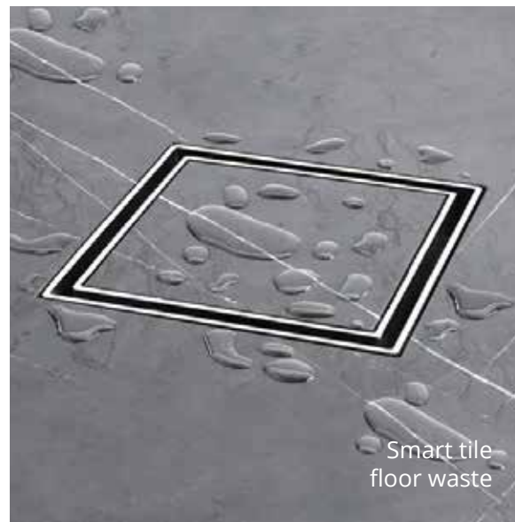
Smart tile floor waste