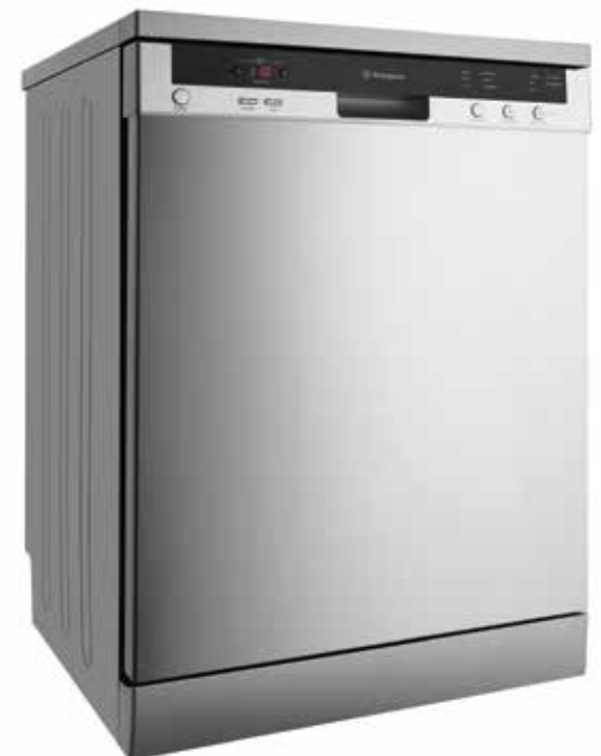
Westinghouse stainless steel dishwasher (WSF6606X)