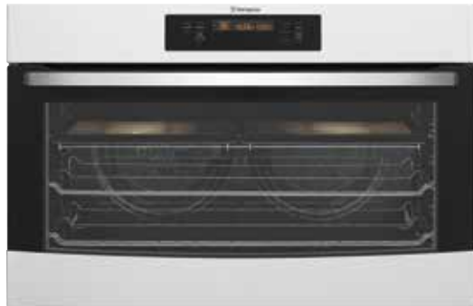
Westinghouse 900mm electric stainless steel oven (WVE916SB)