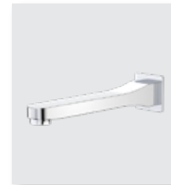
Dorf Viridian wall bath outlet (811021C)