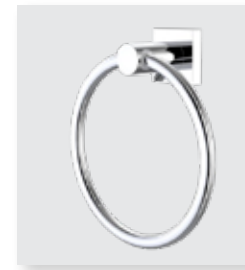
Dorf Enix Towel ring (2995.04)