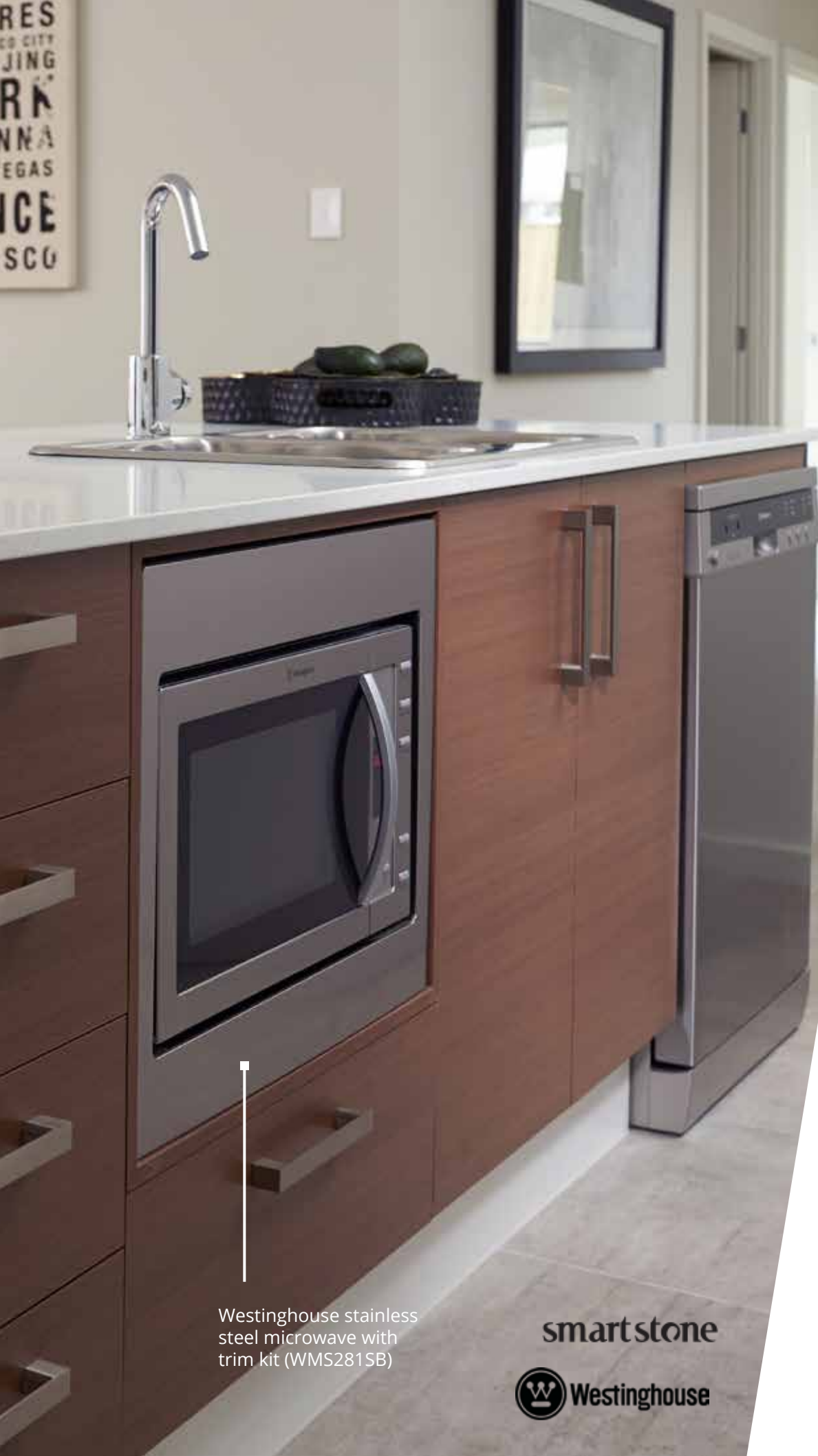
Westinghouse stainless steel microwave with trim kit (WMS2815B)