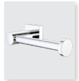
Dorf Enix Toilet roll holder (2287.04)