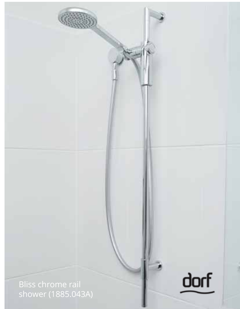
Bliss chrome rail shower (1885.043A)