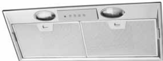
Westinghouse 700ml integrated rangehood (ERI712SA) includes external ducting with painted bulkhead to overheight and full height cupboards