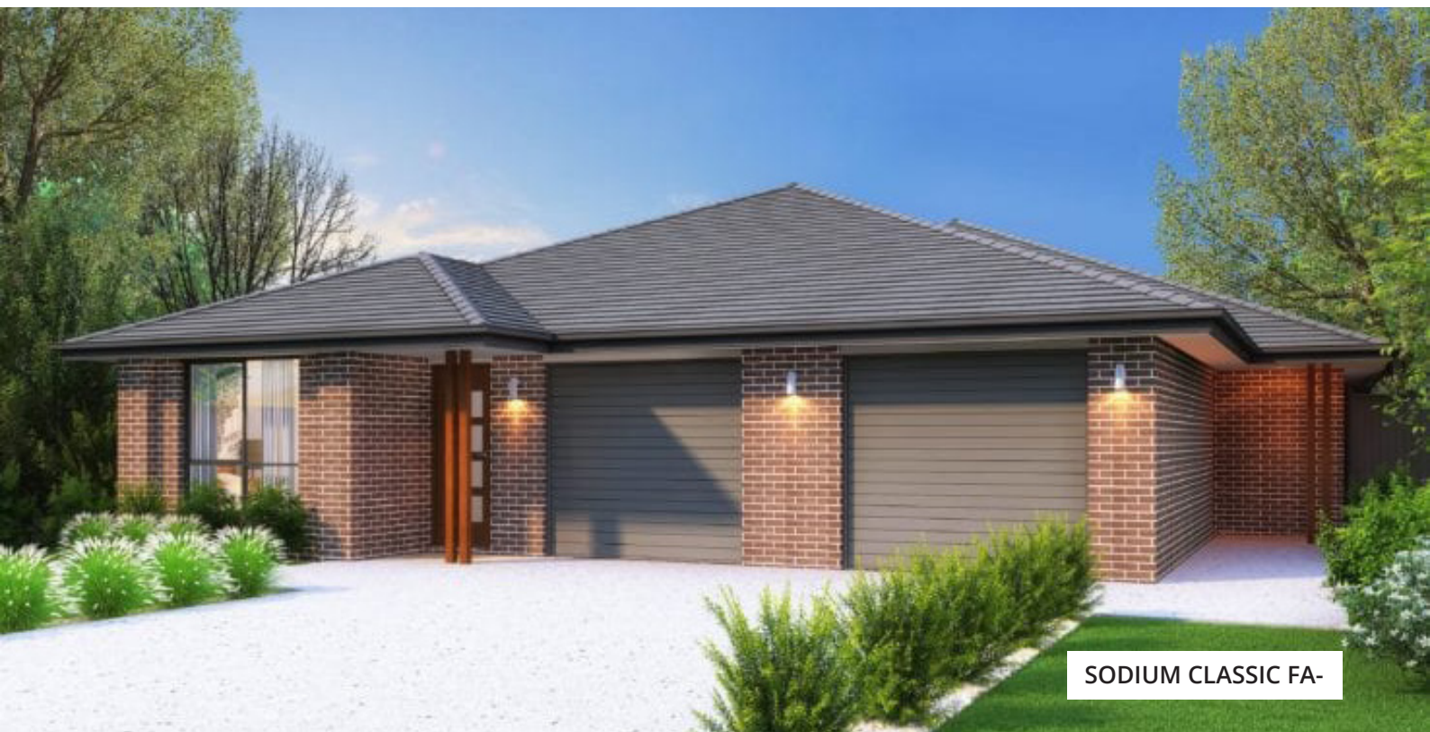
SODIUM CLASSIC FA-