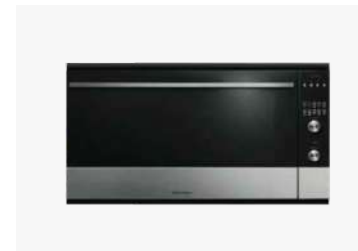
900mm Appliances from H2 Specification