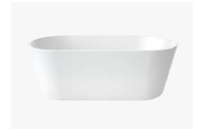
Free-standing Bath - (One Wet Area Only)