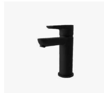
Tapware Upgrade (Black or Brushed Brass)