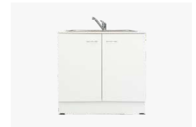
1200mm Laundry Cabinet - (Laminated benchtop Only)