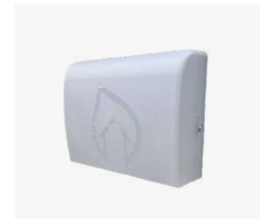
Complete Home Filtration – CHF 6000 15" System