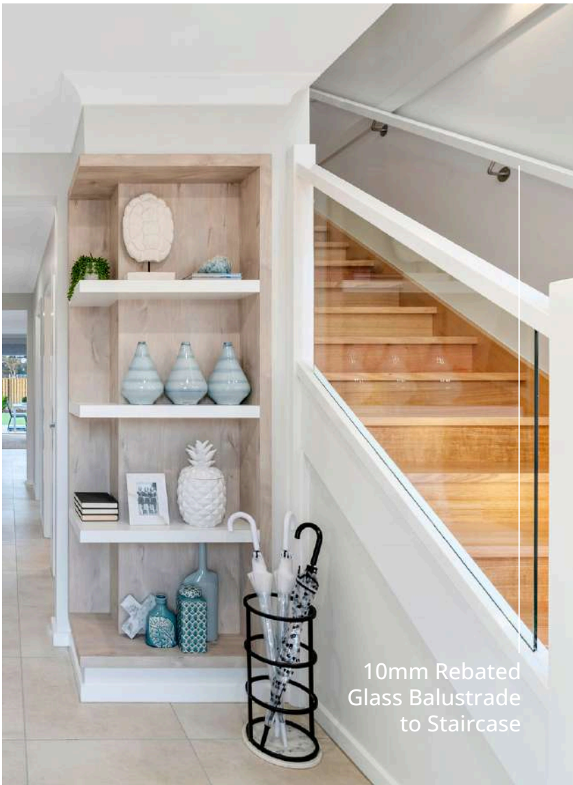
10mm Rebated Glass Balustrade to Staircase