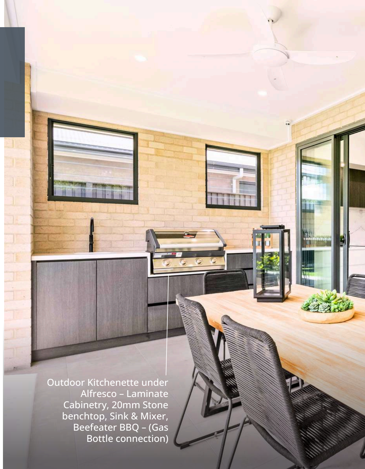
Outdoor Kitchenette under Alfresco - Laminate Cabinetry, 20mm Stone benchtop, Sink & Mixer, Beefeater BBQ - (Gas Bottle connection)

10mm Rebated Glass Balustrade to Staircase